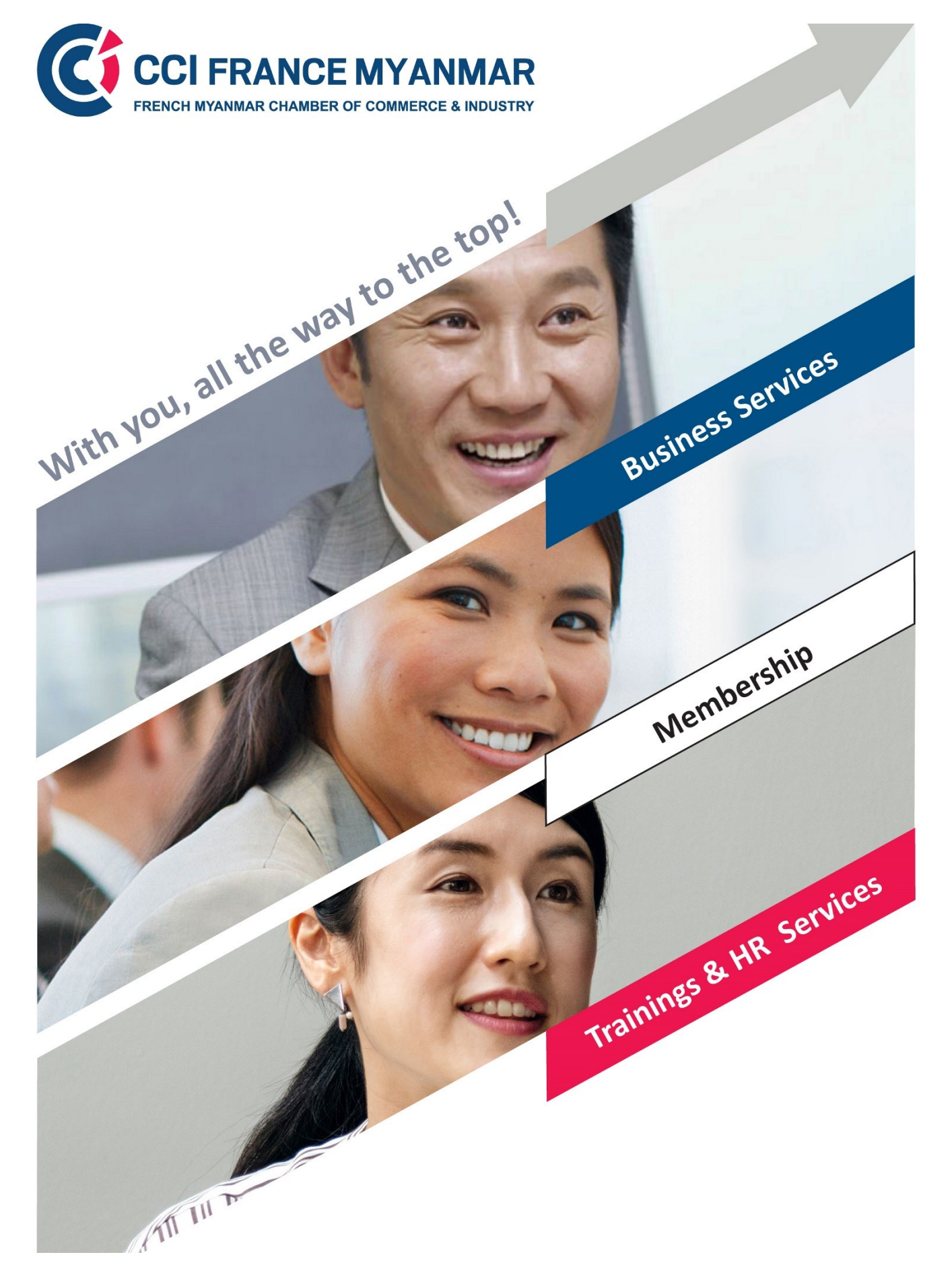
More information on our services: www.ccifrance-myanmar.org